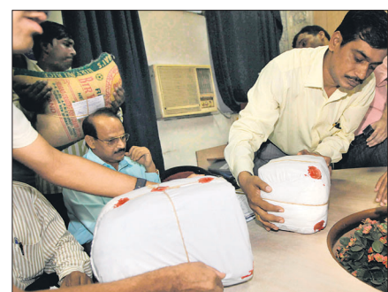
Some of the seized drugs GANESH SHIRSEKAR

In yet another raid the same day, the spe-